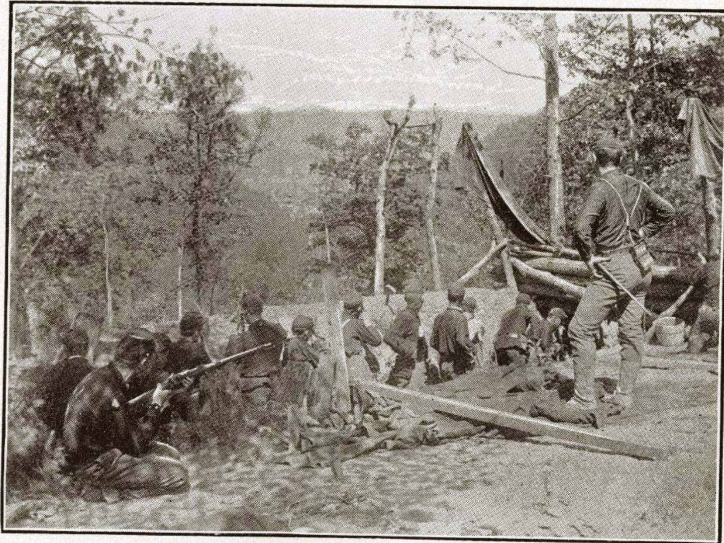
In the Trenches Answering the Attack of the Miners.